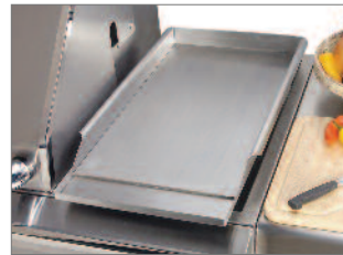
Commercial Griddle. 3/16" solid stainless plate with side & back splash.