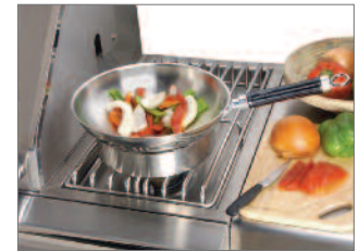
Commercial Wok and Wok Ring. For use on the side burner or on the grill.