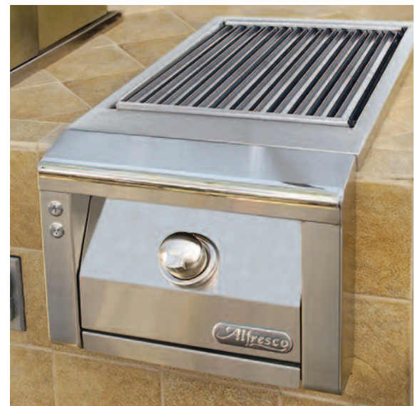
Sear Zone™ Side Burner