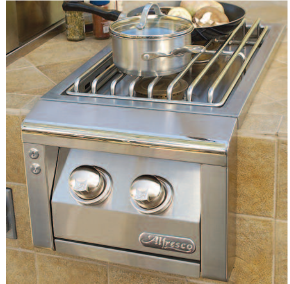
Dual Side Burner

*All side burner units with a serial # starting with "18" have 110 VAC ignition system and "control knob accent lights".